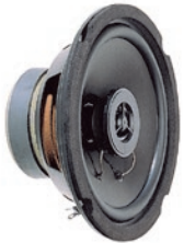
with professional 2-way coaxial chassis